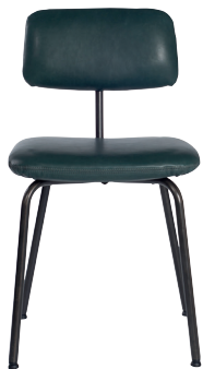
Without arm, old glory