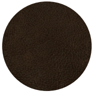
Bonanza Dark Brown