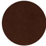
Bonanza Dark Tan