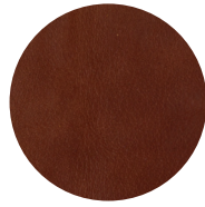
Bonanza British Tan